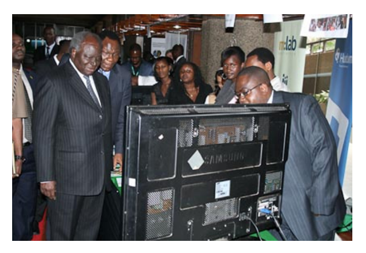
Kenyan president Mwai Kibaki inaugurates the Kenyan Open Data portal in July 2011.

the UN General Assembly. Social media and SMS-text have already allowed tens of thousands of Kenyans to make use of the information.