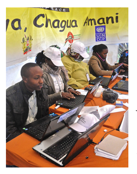
The UWIANO Platform for Peace monitors SMS-text messages during Kenya's constitutional referendum, August 2010, in Bomas, Kenya.

UWIANO was structured as an information partnership. Its partners made use of new information pathways to scale and aggregate citizen complaints, to network, and to engage government and provide feedback. Its first test was the referendum for a proposed new constitution in Kenya, which was held on August 4, 2010.