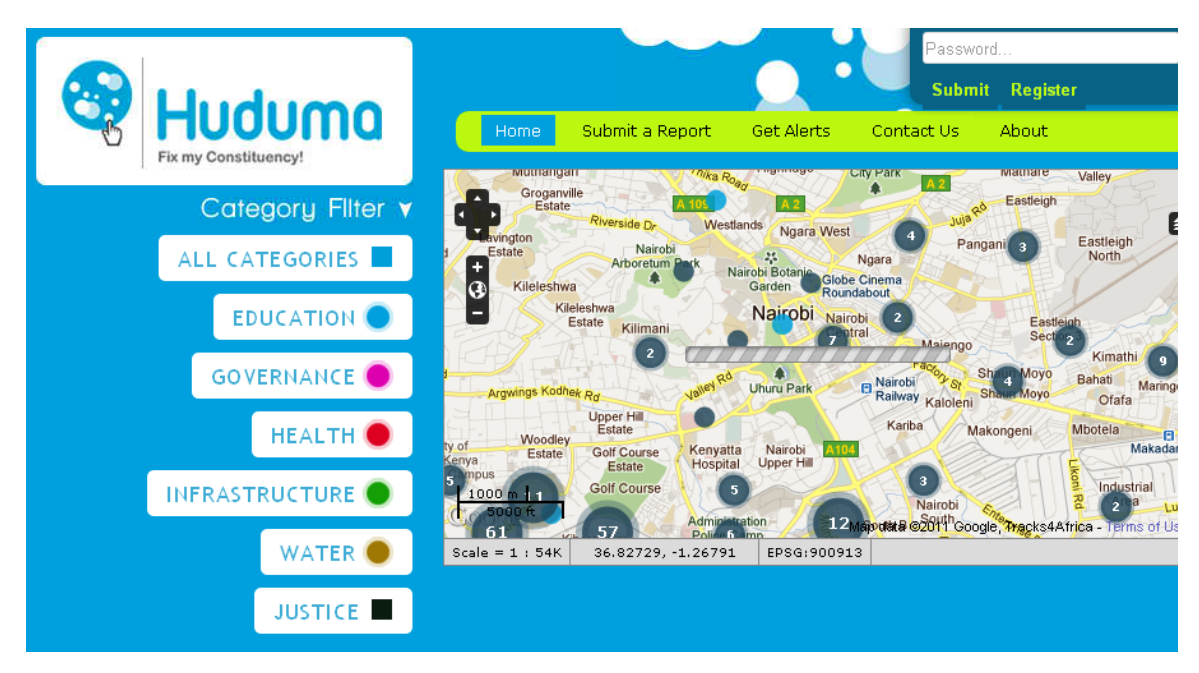
Huduma.org is a software platform for evidence-based advocacy

the data to pressure the government to deliver on its promised funding, and to install more effective monitoring mechanisms for the funds.