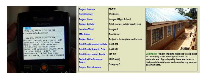
Budget Tracking Tool for monitoring Constituency Development Funds.

A final area to be examined in the application of citizen accountability is public service delivery. Can citizen feedback become a tool to improve the quality of government provided