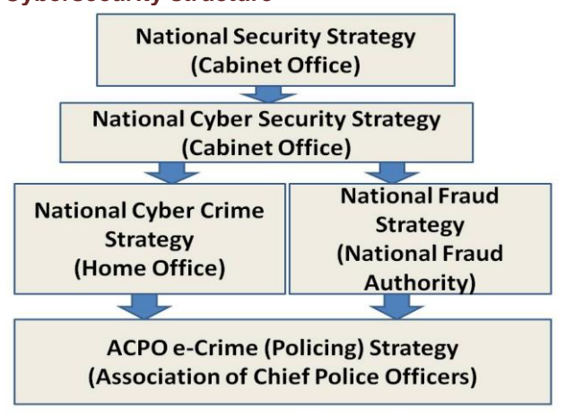
Fig. 1 The UK Cybersecurity structure

Central to the UK's cybercrime policing response is a combination of a new national policing capability and new internet crime reporting facilities. The new Action Fraud reporting centre was established in late 2009 as a central point of contact for the public. Supported by the National Fraud Authority it receives reports of frauds and related forms of cybercrime such as phishing (id theft) which are currently the main type of cybercrime affecting individuals and