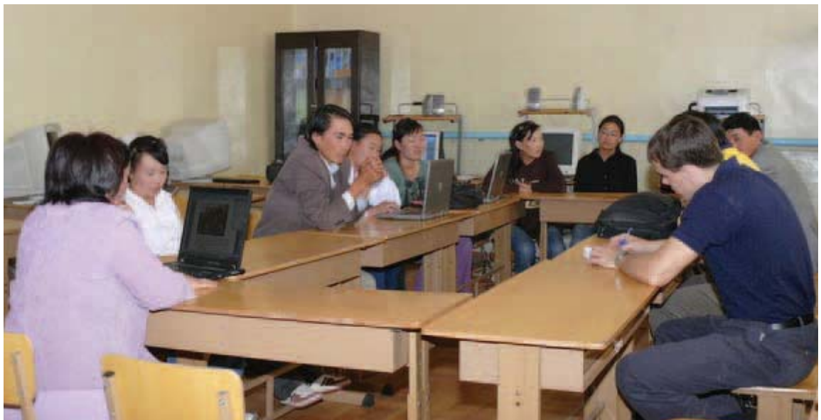
9 June 2007.

This strategy also allowed IIREM to tap existing resources. 10 IIREM engaged a range of stakeholders to develop offline materials