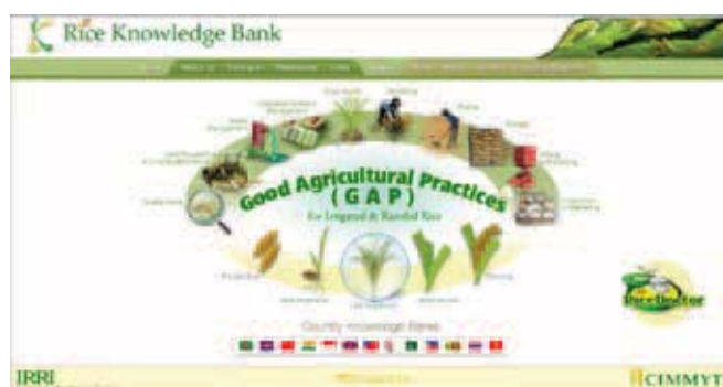
Rice Knowledge Bank homepage, www.knowledgebank.irri.org/rice.htm (screen captured on 7 April 2010).

Following is a summary of information related to the ADB technical assistance for the Rice IT project.