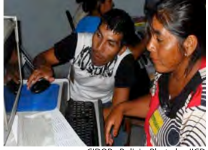
CIDOB - Bolivia.

The training was tailored to political leadership and succeeded in building the women's self-worth. Through the use of interactive platforms such as blogs and wikis, the women's appreciation for information exchange grew. The Internet was not the only medium through which the female indigenous leaders found and articulated their voice. Some of the traditional media such as television and radio were used to increase outreach opportunities. For example, through television an advertisment campaign on the new constitution was subjected to a gender analysis that gave special focus to the unique rights and needs of indigenous women in Bolivia.