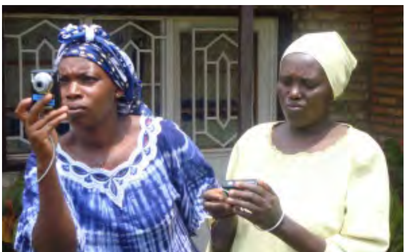
Women's digital baskets - Rwanda.

assumption that women are not socio-culturally predisposed towards ICT. The new skills opened up possibilities for the women in society such as providing secretarial services to the community.