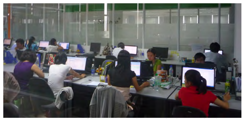
One of the ICT Companies that responed to the survey.

While the survey results revealed an increasing percentage of women involved in corporate research and development as well as corporate management, the same companies harbor doubts as to whether such a market for products specifically giving focus to women exists. This can partly be explained by the fact that the majority of the production of these enterprises is on a sub-contractual basis. Production is thus geared towards contractual obligations.