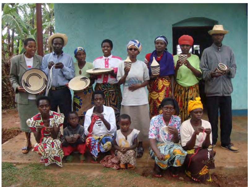
Women's digital baskets cooperative - Rwanda