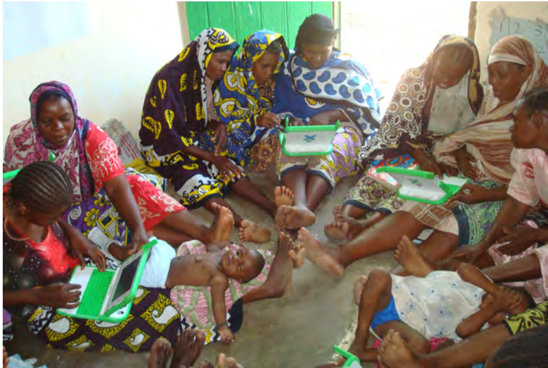
SHGs using XO Laptops

More than 89 women in the coastal villages of Kenya<sup>16</sup> were brought together with a small percentage of men who were also members of the SHGs. Given that fishing is a key activity in those villages, the project sought to empower women by introducing supplementary income generating activities to their families. This was intended to reduce over-reliance and pressure on marine resources. The infrastructure in Kenya was a challenge as none of the SHGs had access to electricity in their meeting areas. The e-learning materials covering numeracy, literacy and environment that had been developed were provided on XO laptops. These laptops had been used in other places for 'one laptop per child' projects and were well suited given their compact hardy frame that is able to withstand much handling as they were shared by group members.