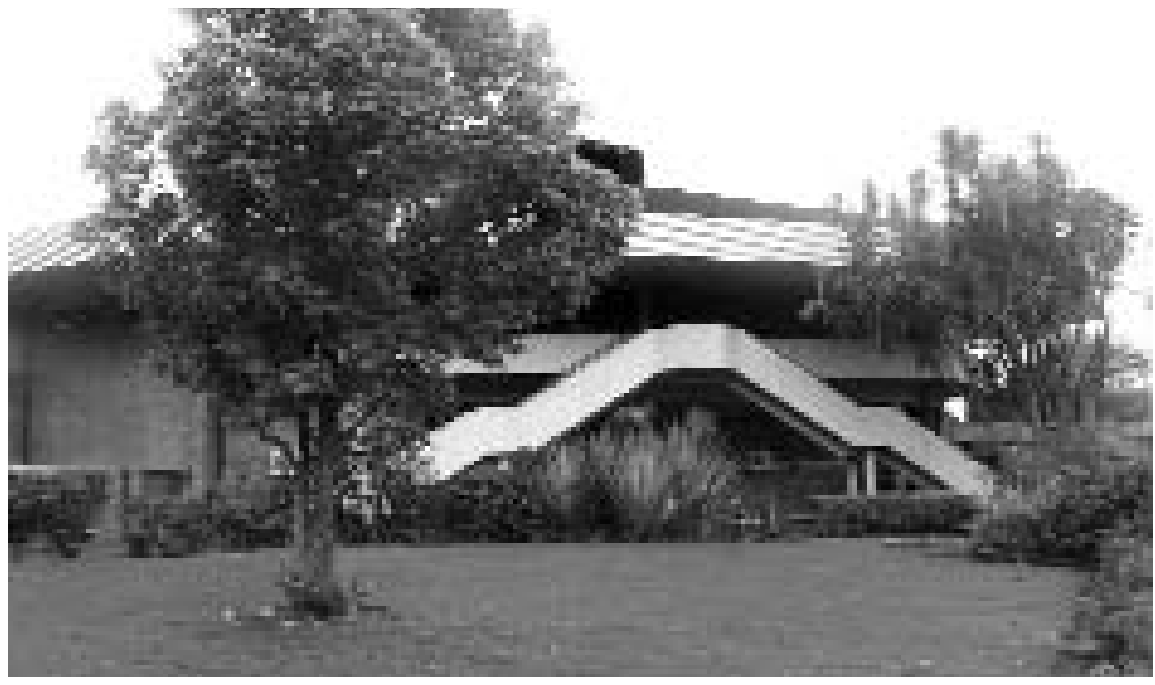
Chancellor College, Malawi

in developed countries. In order to promote Internet connectivity for the tertiary education and research sectors, the Malawi Research and Education Network (MAREN) was established in October 2005. I joined MAREN in 2006 soon after my return from Australia and I am part of a task force that oversees its operations. MAREN has successfully lobbied for the use of existing fibre owned by the Electricity Supply Commission of Malawi (ESCOM). This is strategic because the main fibre line runs close to most tertiary education and research institutions. MAREN is now seeking financial, technical, and material assistance to connect institutions that are not close to this main fibre line. The options explored at the moment are fibre and wireless connection.