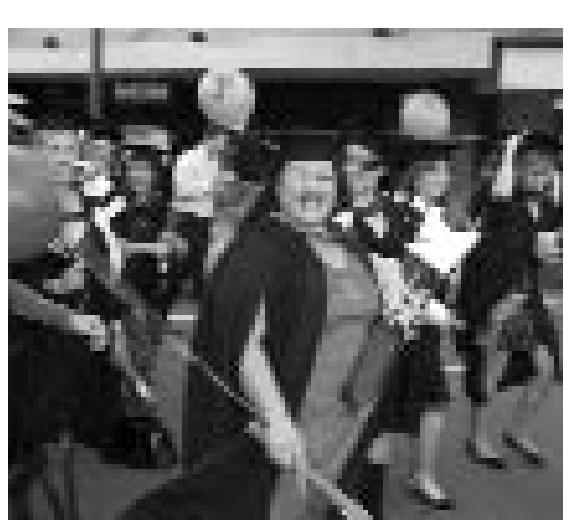
Eldest daughter graduating with a Bachelor degree in Anthropology, Massey University.