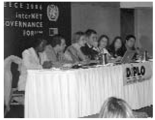
Diplo workshop in IGF Athens, 2006