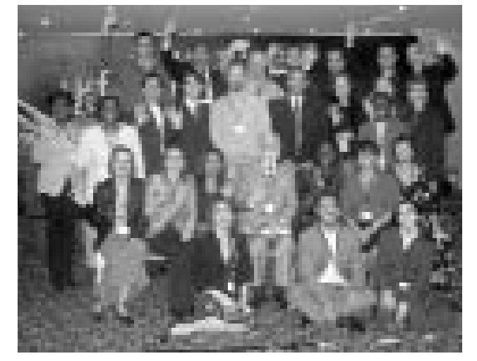
Discussion session with Vint Cerf in IGF Athens