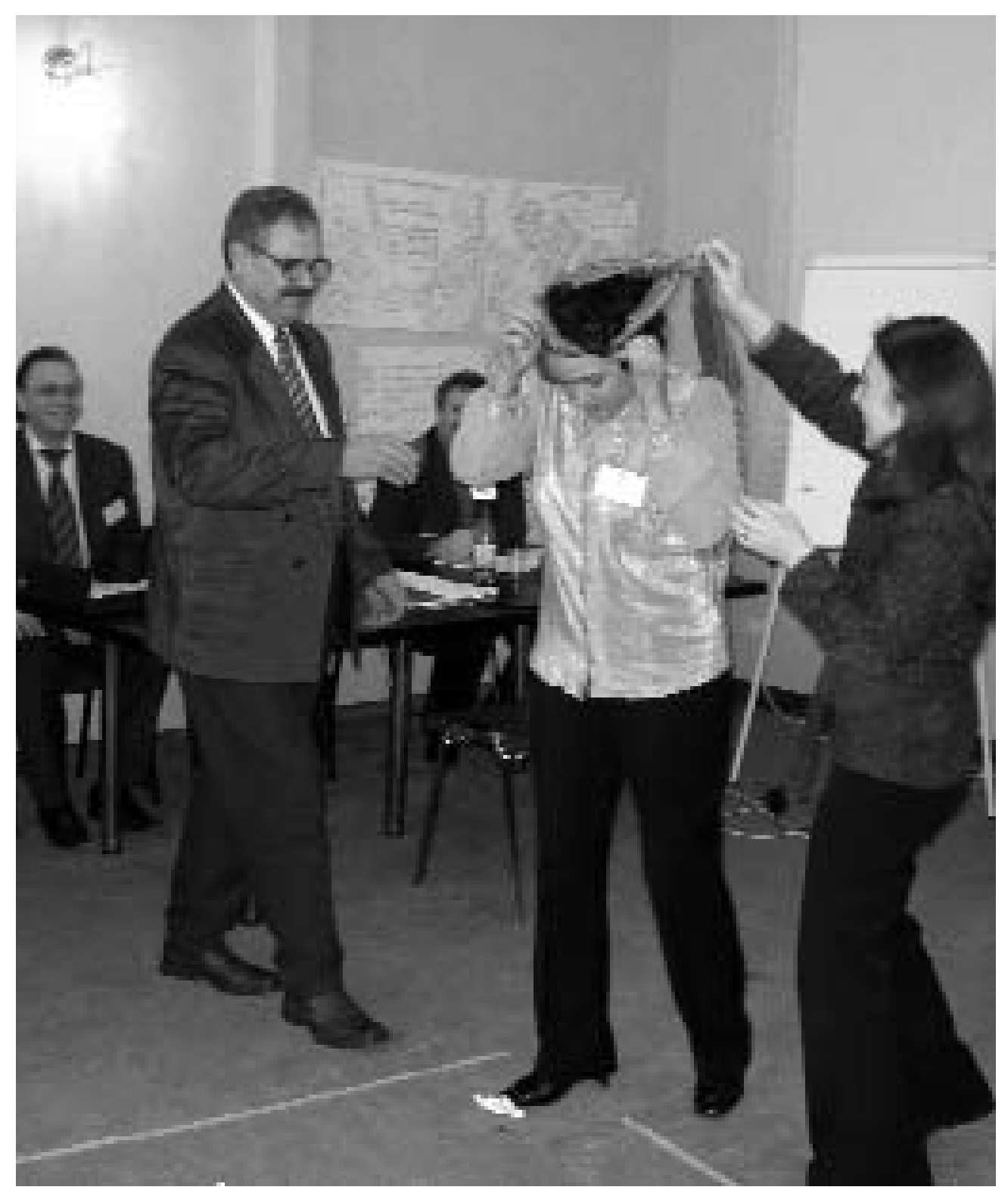
Training Program organized for Trade Union representatives on HIV/AIDS policies at the work place held in March 2007. The photo captures a session focusing on the multistakeholder approach to policy development in this area. The game "Mine field" has several steps, but the key part is having several participants take turns to cross the field with eyes closed while being guided by someone else. While debfiefing the game, the participants were asked "What can really help a person cross through this mine field?" Participants answered that proper guidance from someone who knows the situation and has experience would help, and that crossing the field with open eyes could help even more. Participants drew parallels to the multistakeholder approach to policy development and the importance of the 'guide' in the process.