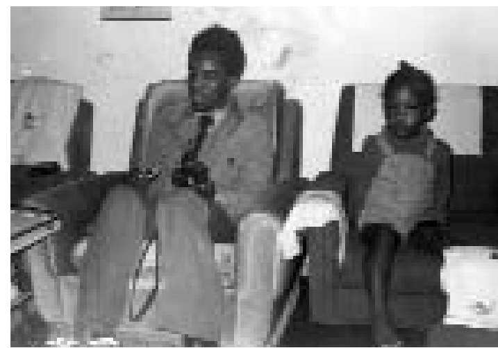
3 years old with uncle