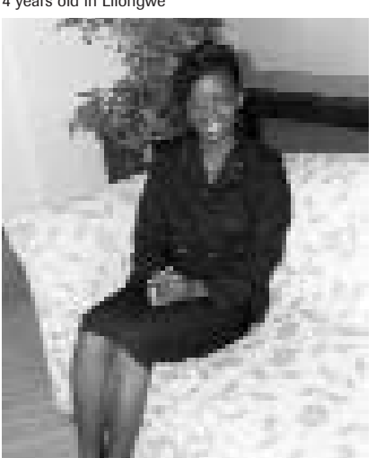
Final year student (BSc), Chancellor College