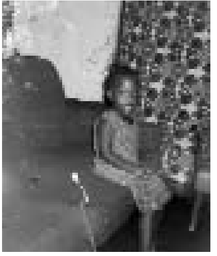
4 years old in Lilongwe