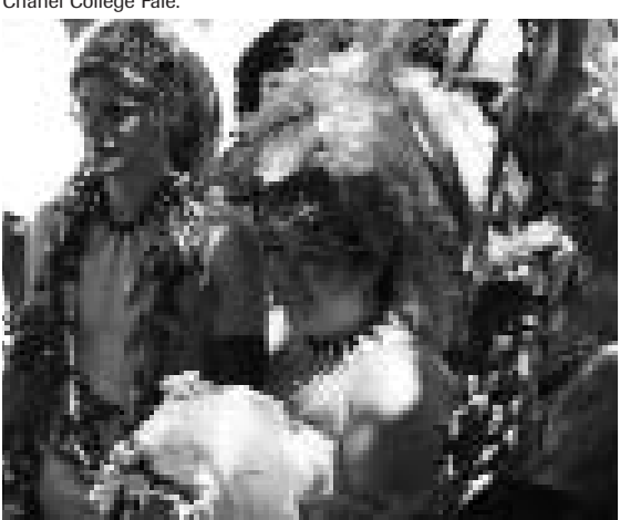
Eldest daughter getting married the traditional way.