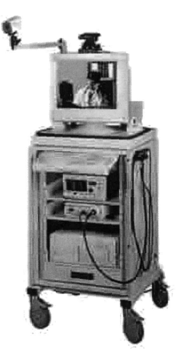
FIG. 2. GCS 7600 Mobile Telemedicine System.

The GCS 7600 Mobile Telemedicine System,<sup>22</sup> shown in Figure 2, is a complete diagnostic system consisting of a hospital-grade cabinet, desktop PC with videoconferencing system, and a comprehensive suite of tele-